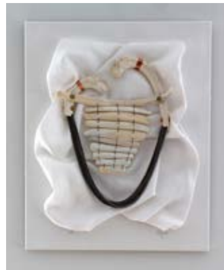
Future Chainged Coat of Plates Mixed media 20 x 16 x 3 inches