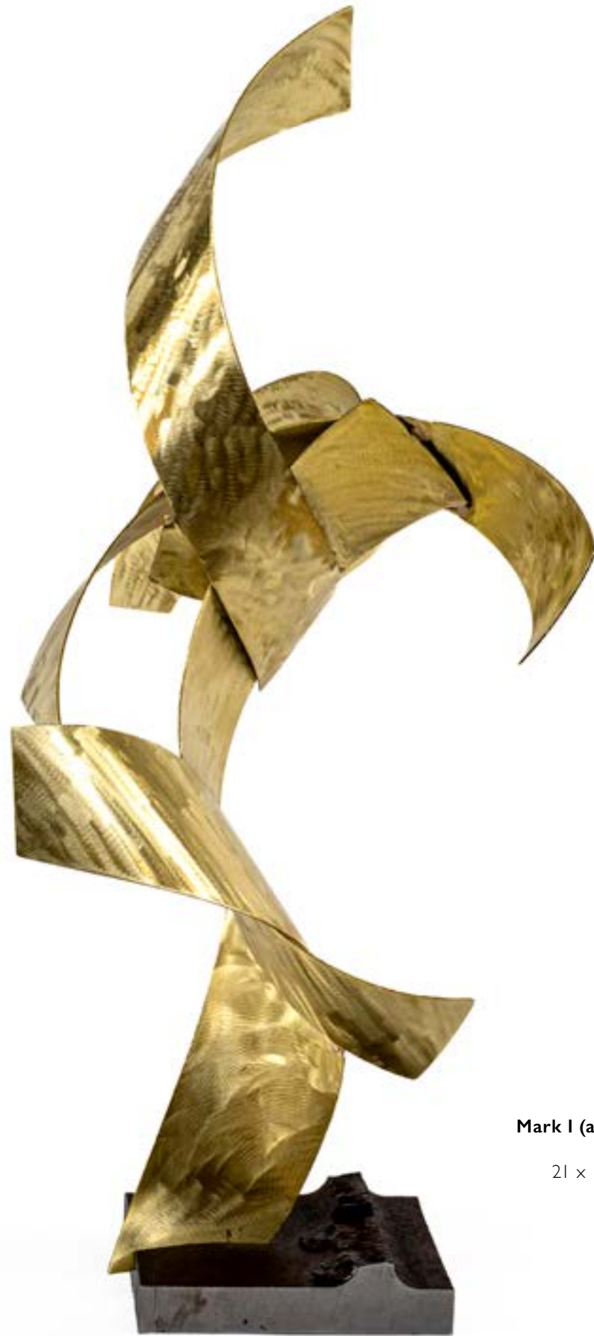
Mark I (aka Collision) Brass, steel 21 x 12 x 10 inches