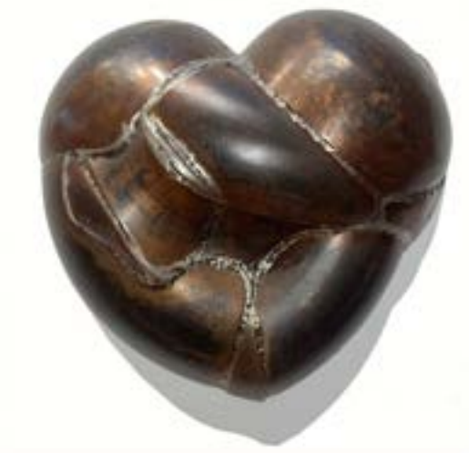
Reconstructed Heart steel pipe, stainless steel 16 x 17 x 5 inches