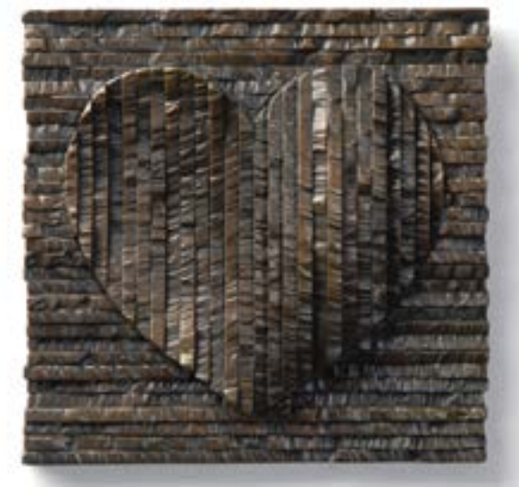
Layered Heart Cast Resin with faux bronze finish 8 x 8 x 2 inches