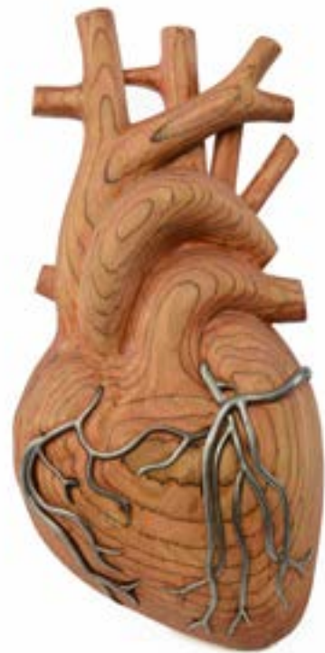
Anatomy Of A Heart Plywood and Steel 20 x 9 x 3 inches

The human heart fascinates. It is the center of our emotions and a symbol of love. It is also an organ, a mechanical pump that circulates the blood throughout our bodies. My heart sculptures explore this duality represented in both its anatomical and metaphoric form. These interpretations of the heart reflect my inner self and spiritual journey.