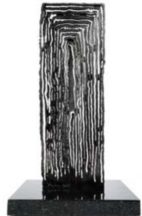
(R) Off Axis Steel, marble 18 x 10 x 10 inches