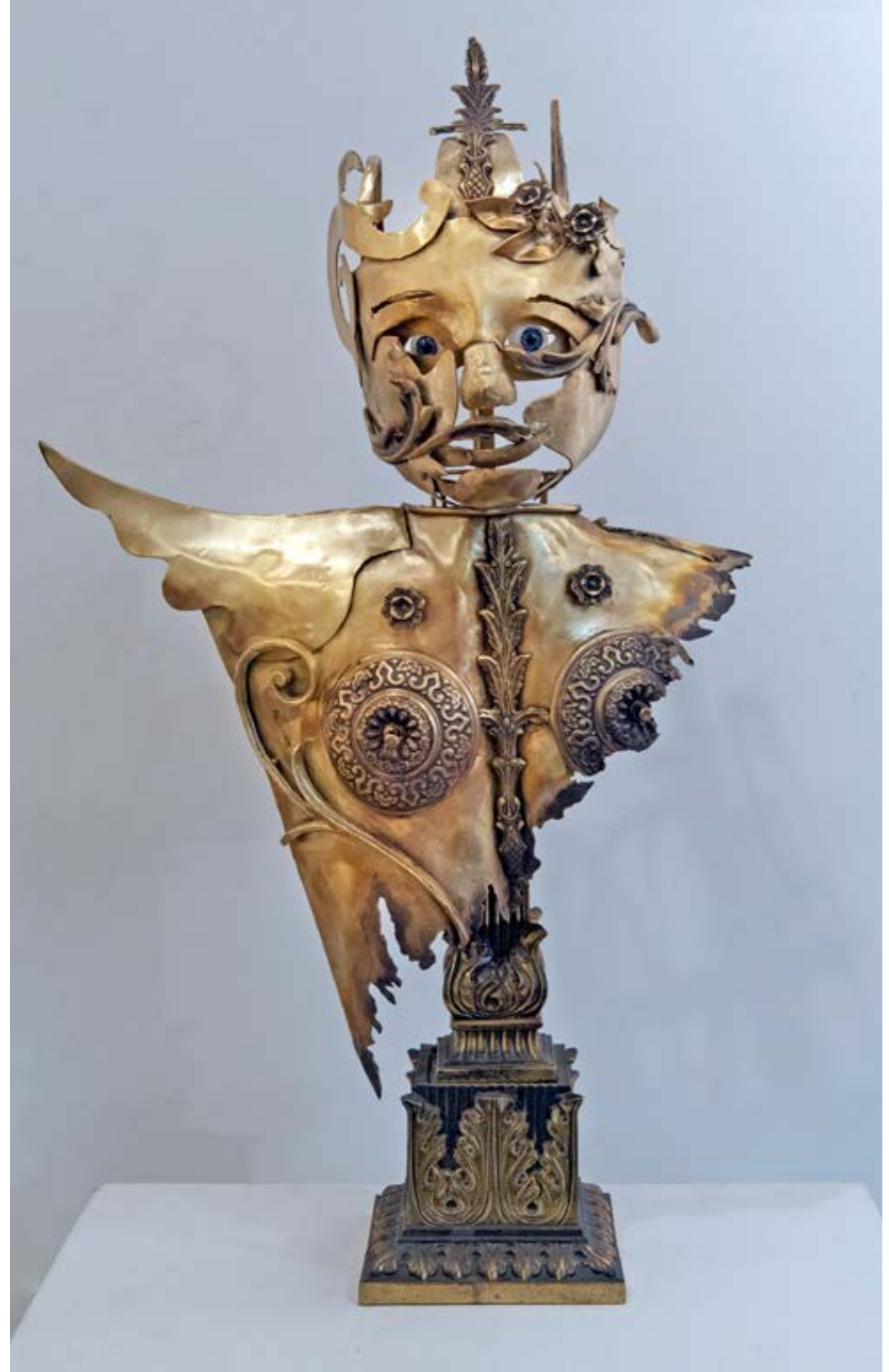
(R) She Needs Her Armor Brass, glass eyes, found objects 31 x 20 x 17 inches