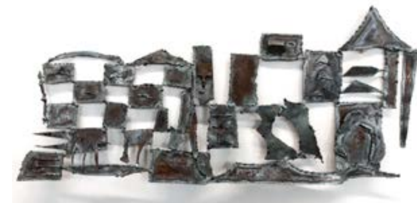
Floor Plan Steel 14 x 30 x 2 inches