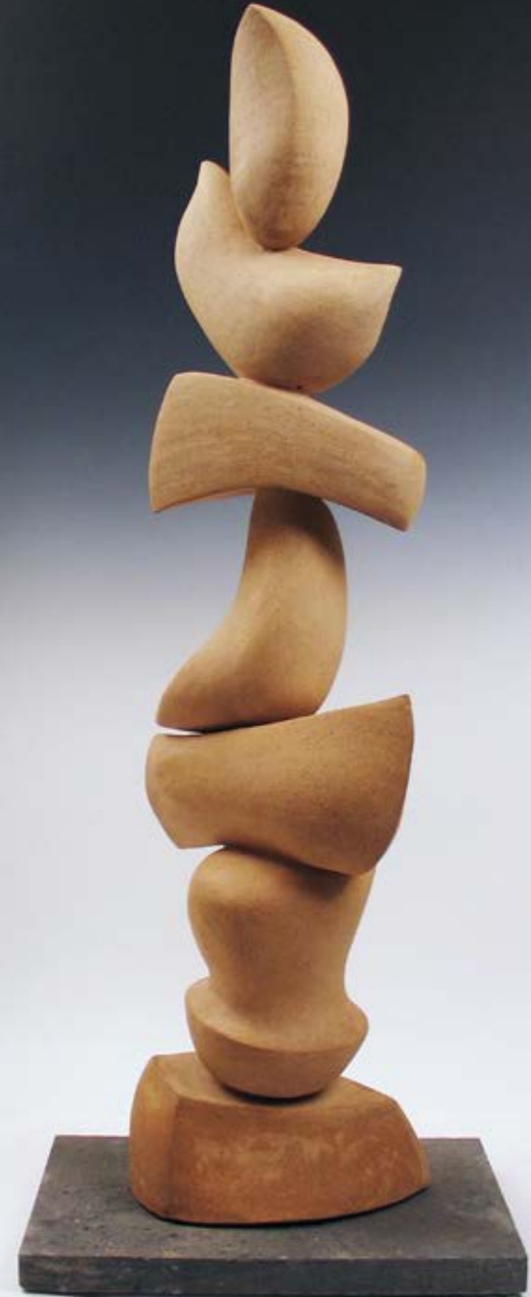
Precarious Balance Ceramic with bluestone base 44 x 12 x 9 inches

Initially I created several pieces involving visual unbalance, depicting the unsteadiness and anxiety I was feeling at the beginning of the lock-down. More recently I created this stacked piece, much larger and more stable than earlier pieces, but still with a feeling of danger and unease.