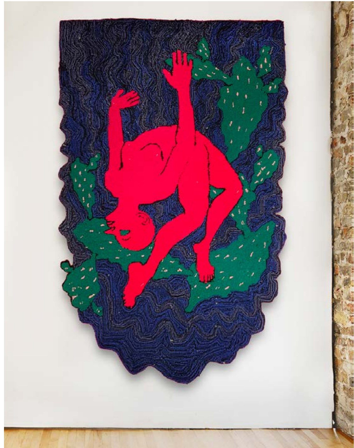
Falling Figure Tufted rug 64 x 42 inches

One of the defining features of my work is the use of chromadepth techniques, which I employ to create the illusion of three-dimensions. Through the use of these techniques, I am able to create pieces that are visually striking and that engage the viewer in a dynamic and immersive experience. When viewed through chromadepth glasses, the rugs take on a whole new dimension, and the viewer is transported into a world of vivid color and depth.