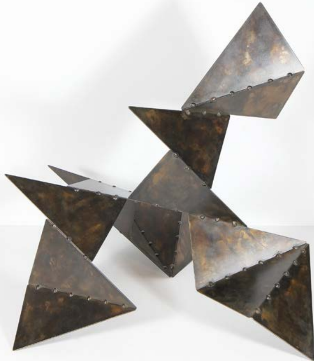
Amorphous 8 Welded steel triangles, custom patina, wax 16 x 17 x 15 inches

All of these call the user to reach out and touch the sculpture which I strongly encourage. There was a time when I tried to break away from my engineering background while making my sculptures, but I have learned to embrace and enjoy that aspect of my art. I understand that this is how I view my work today—where process and material share in the finished product.