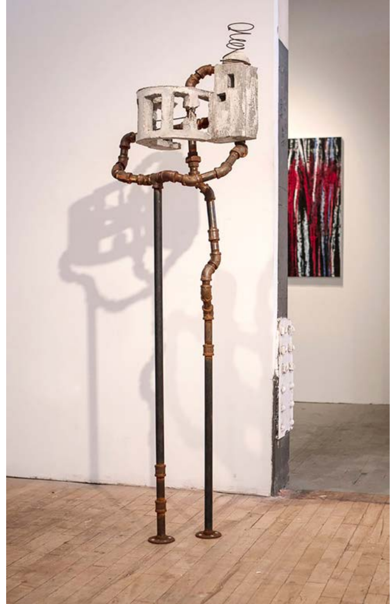
Pipeline to the Rose Garden Concrete, steel pipe and spring 66 x 20 x 16 inches

Petroleum industry rules the modern world. That is the fact that underlies most of my work in drawing, printmaking, and sculpture. Unfortunately, the White House provides a nexus between Big Oil and most institutions of government. Pipeline to the Rose Garden embodies this phenomenon. Enough said.