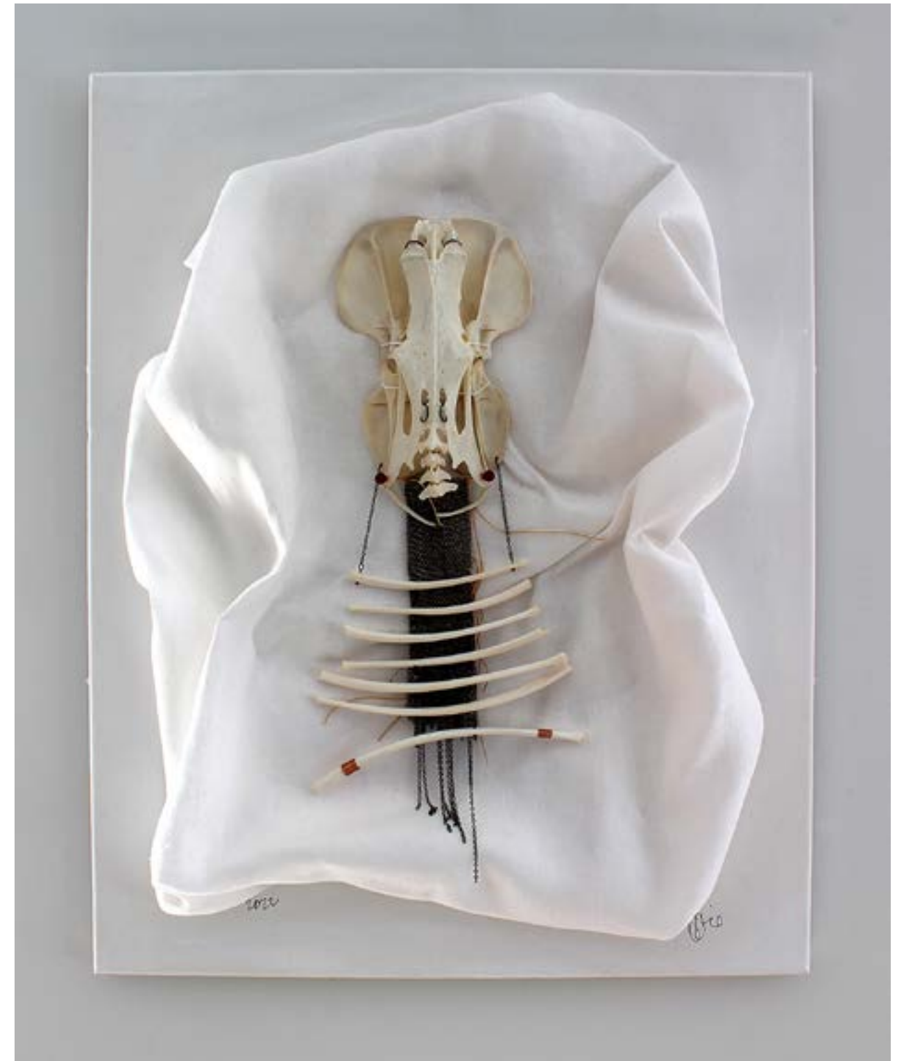
Past Future Chainged Hauberk Mixed media 20 x 16 x 3 inches