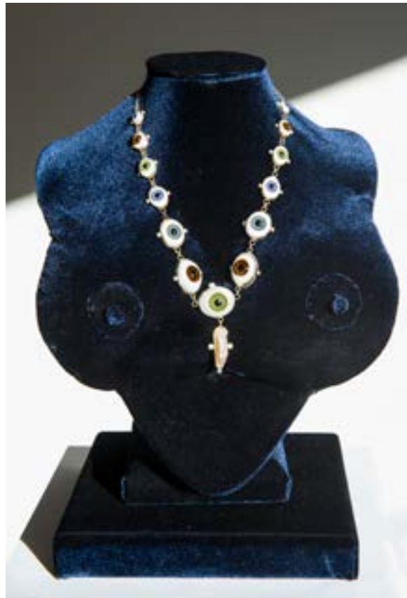
(L) She Felt His Gaze Paper mâché, velvet fabric, sterling silver necklace set, glass eyes, fresh water pearl 14 x 11 x 8 inches

Surrealism and the Renaissance influence my work. My ornate sculptures inhabit an allegorical tale. My shaped paintings with fabricated embellished frames form the background of the scene. My goal is to illustrate how society's contemporary view of women has evolved, and yet has not fully evolved, from the historical myth.