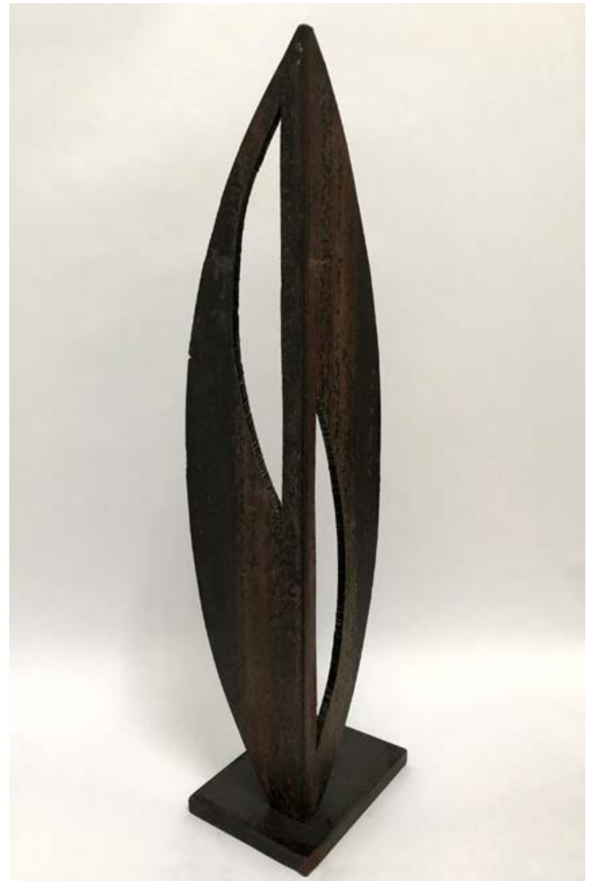
(R) No. 711 Steel 30 x 8 x 5 inches