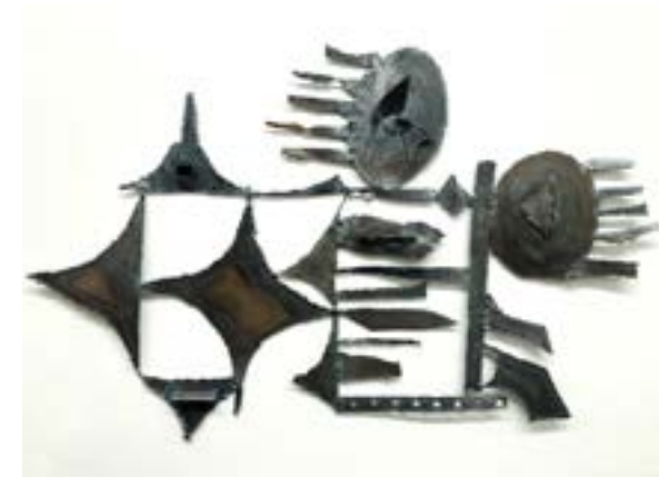
Which Way Does the Wind Blow Steel 17 x 29 x 2 inches

I engage in long-term collaborations, particularly with Malian artists. We are all, at the same time, researcher and object of research producing dialogue and concrete works of art. Working trans-culturally unites people from different cultures, education, histories. The exchange of perspectives and contexts can highlight global similarities and specific cultural differences as contributors think together, contributing beliefs and strategies from their individual experiences. As the work continues over a long period of time, the result can be an identity that is not exclusively linked to a geographic location or ethnicity but to new cultural and conceptual realms.