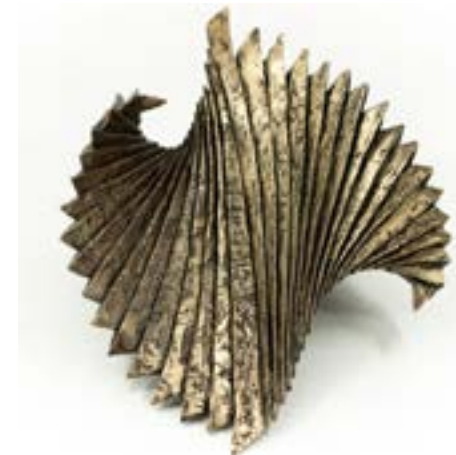
(L) Nothing Orthogonal Bronze 15 x 15 x 15 inches

Like an alchemist, I use metals as a favorite medium. Metals can bend, scatter, refract and reflect light while also being physically formed, shaped, and textured. Metals interact with the environment physically and perceptually; expressing the ravages of time on a scale different than our bodies, revealing our own impermanence on this planet and the ultimate triumph of entropy.