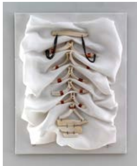
Imperfect Chainged Armor Mixed media 20 x 16 x 3 inches

All three of these pieces embrace my fearfully cautious and still optimistic view of the future.