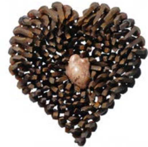
Resilient Heart Marble, railroad spikes 72 x 24 x 16 inches