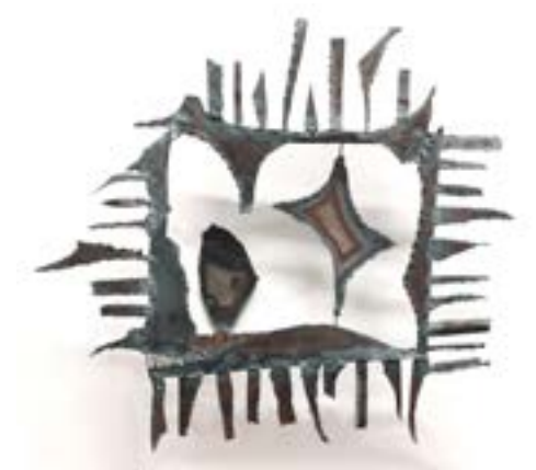
Box Steel 20 x 22 x 5 inches