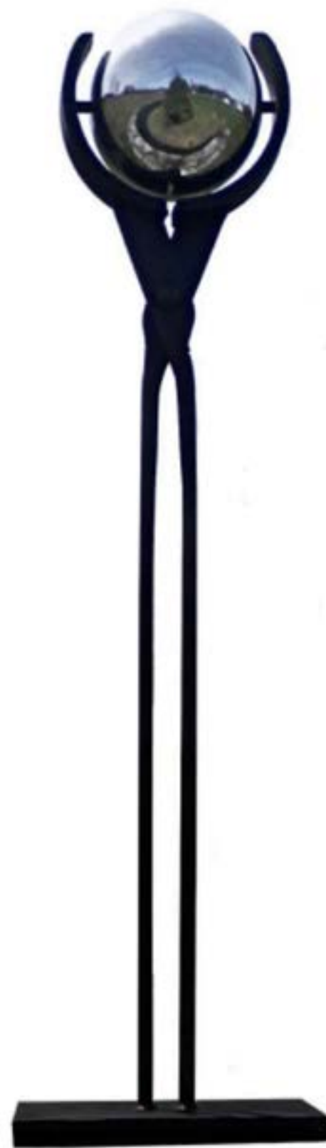
Eye of the Beholder Iron, steel 51 x 14 x 8.25 inches

My home and studio are located in Stanfordville New York, a rural community in the Hudson Valley. The area has a long agrarian history and culture that depend upon, and value, both work and the tools of labor. It is a place that provides both inspiration from, and access to, discarded and decaying materials and artifacts ripe for transformation.