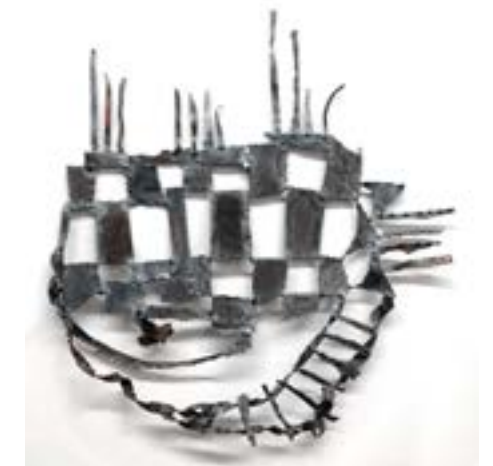
Boat Steel 20 x 16 x 2 inches