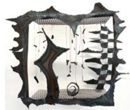
Box 2 Steel 22 x 24 x 8 inches