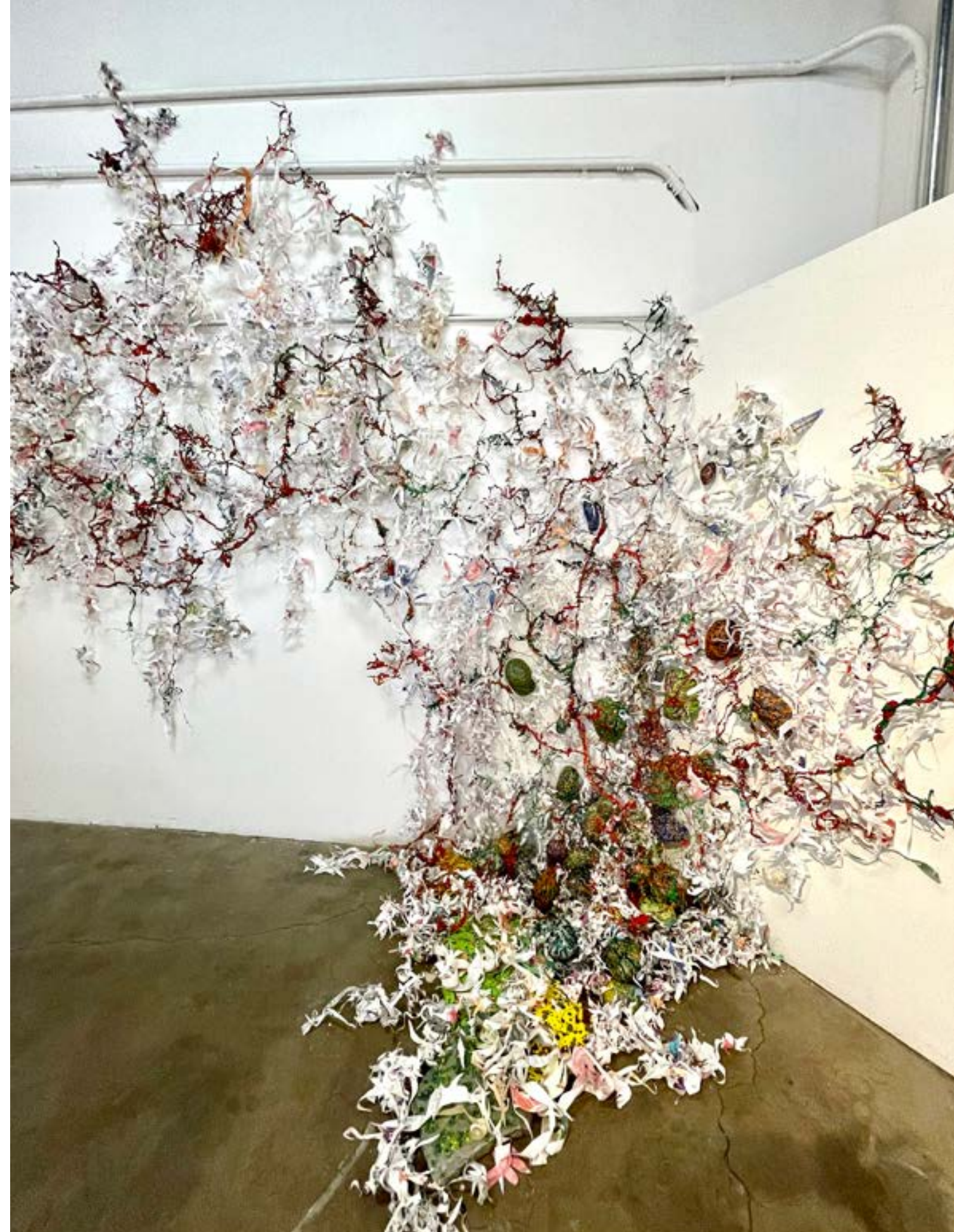
Crossing Borders Site Specific Installation Wire, acrylic, paper 10 x 8 x 4 feet